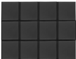
1x Blanket Solar Panel