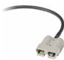
1 x High current flylead