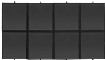
1x Blanket Solar Panel